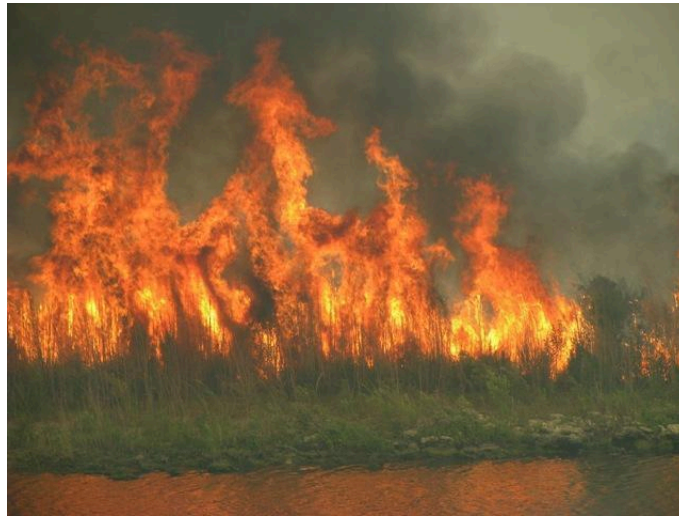
Wildfire on a dry grass bed in Lake Okeechobee

The typically dry winter and spring of South Florida means that our area is prone to prolonged periods of little to no rainfall. This increases the threat of wildfires which peaks during the spring months from March through May when the dry season coincides with windy conditions, increasing sun angle, and warmer temperatures. Wildfires are not only most common in the Everglades, but also near the urban-wildland interface on the fringes of the urban areas of South Florida. This was the case during the spring of 2017 when several weeks of little rainfall led to severe drought conditions over Southwest Florida. The result was one of the worst wildfire seasons in recent memory in Southwest Florida. Three wildfires affected the Golden Gate Estates and Picayune State Forest in March and April of that year. Total damage caused by those wildfires was over $4 million, with 18 structures destroyed. The wildfires triggered the evacuation of portions of Golden Gate and the closing of roads, schools, and businesses in the area. Fortunately, no deaths were reported and one man was injured while trying to save his property from the fire.