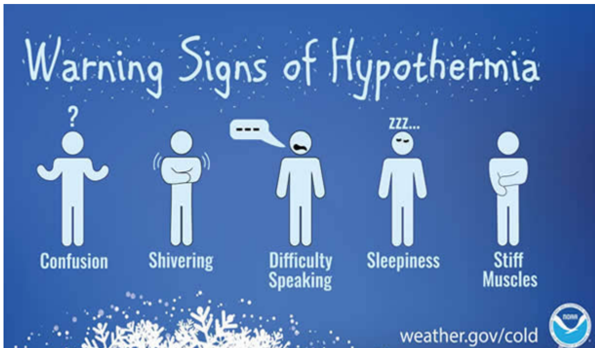
Warning signs of hypothermia

2010, and an additional 7 people were injured from carbon monoxide poisoning resulting from improper use of heating devices. South Florida's agricultural industry suffered losses in the millions of dollars as a direct result of the freezing temperatures.