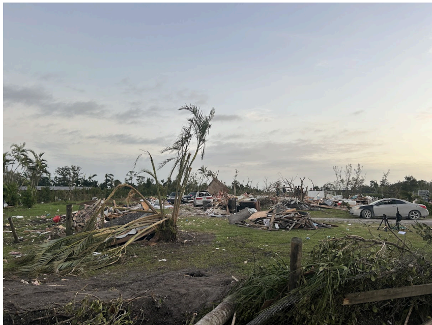
NWS Storm Survey pictures from Wellington EF-3 tornado on October 9th, 2024

Waterspouts (tornadic circulation on water) can be dangerous to boaters as well as to those at the beach. On May 25 th , 2015, a waterspout moved onshore Fort Lauderdale Beach and flipped a bounce house in the air about 30 feet, injuring four children who were in the bounce house at the time. More recently, on April 21, 2023 a waterspout made landfall on Hollywood Beach and caused minor damage to beachfront businesses and tossed umbrellas and beach chairs.