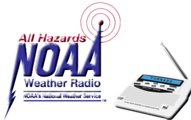
Figure 2: NOAA Weather Radio – important for protecting lives and property.

lives, especially for nighttime tornadoes when people are normally asleep and otherwise wouldn't receive alerts. Local media will also relay tornado warnings via the Emergency Alert System (EAS).