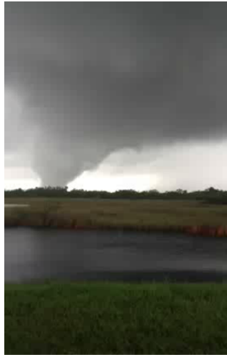
Tornado in Everglades of Collier County on June 24 th , 2012