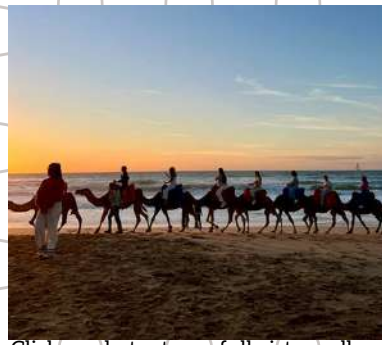
Click on photos to see full picture album