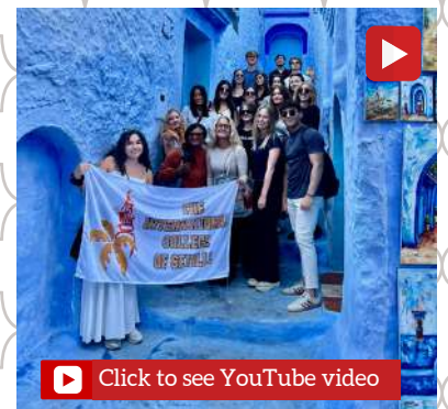
Click to see YouTube video