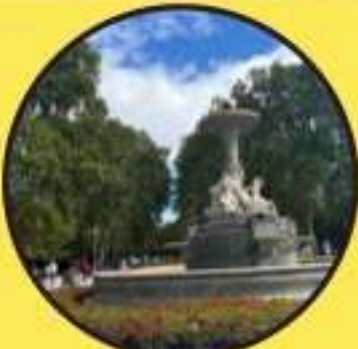
El Retiro Park