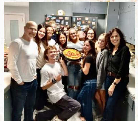
Click on photos to see full picture albums